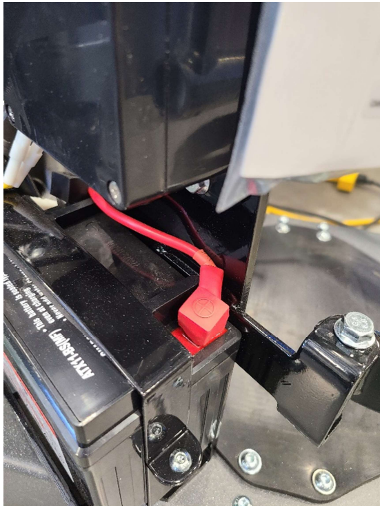
Positive battery cable in incorrect orientation

SOLUTION: Identify positive battery cable and reorient it into correct position using a copper or steel washer to the battery terminal as a spacer to lift the cable, allowing for contact while in proper orientation.