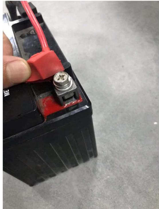
Addition of 1 copper/steel flat washer of about 3mm