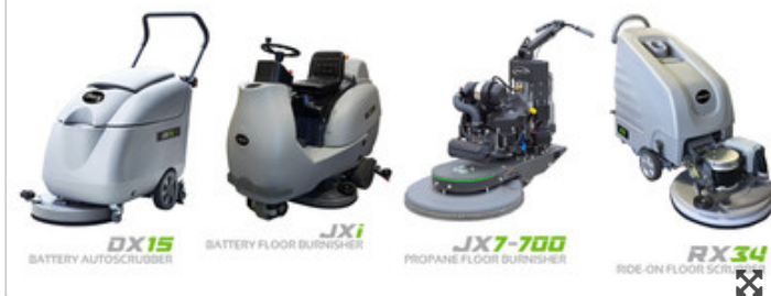
ONYX 2022 New Product Launches

The new facility includes increased product warehousing space and barcode scanning system sophistication with expanded shipping and receiving areas including dedicated areas for incoming material inspection and improved processes and procedures for the packaging of finished goods. The engine-lab operations have doubled in size with the addition of a second dynamometer station for testing and calibrating engine performance. This allows ONYX the ability to test and calibrate every engine fully offline, eliminating any required calibration by OEM at time of assembly/integration to final application.